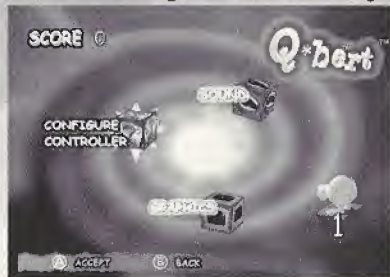
Options Menu Screen

* Press the D-Button RIGHT/LEFT to change the desired setting.